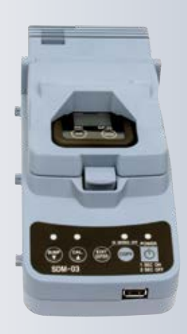
SDM-03 Series Calibration Station