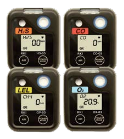
LEL, O2, H2S and CO