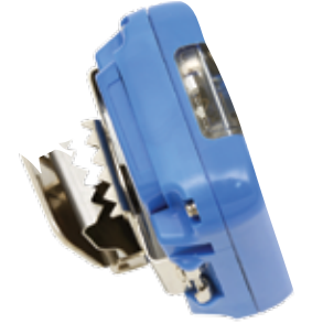
360° rotation alligator clip