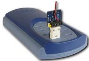
Figure 2: The terminal board fitted to the USB TC-08

The voltage displayed in PicoLog corresponds to the input voltage as follows: