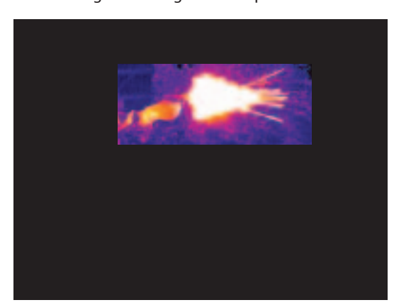
Analog video output in window mode. Image window is surrounded by black edges.

The HS Series camera systems have a built-in frame buffer for simultaneous and independent analog and digital output. An example of this capability would be sending corrected imagery to a video monitor while sending uncorrected data to a digital recording system. This capability also works in windowing mode maintaining the analog video output.