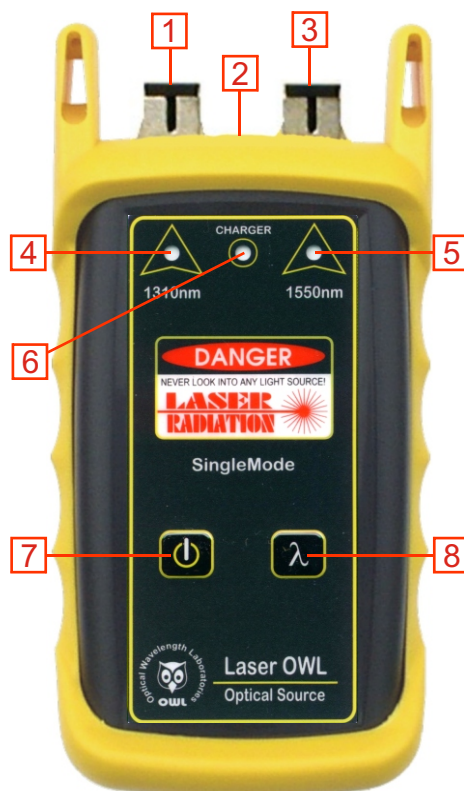
Figure 1 - Laser OWL Singlemode Laser Source