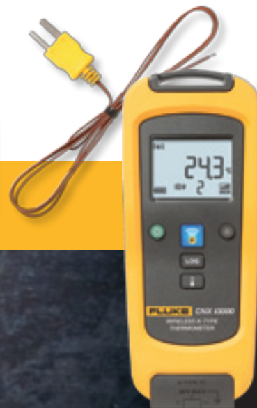
CNX t3000 K-type Temperature Module