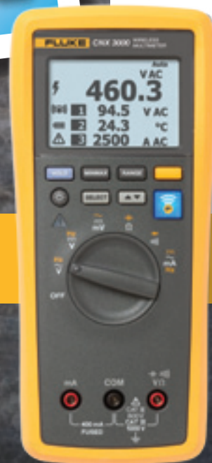
CNX 3000 Wireless Multimeter