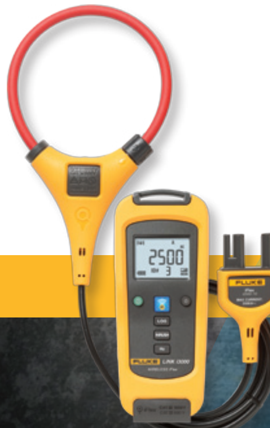
CNX i3000 iFlex™ AC Current Clamp Module