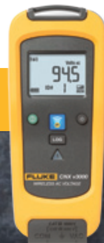
CNX v3000 AC Voltage Module