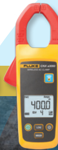
CNX a3000 AC Current Clamp Module