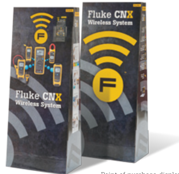
Point of purchase displays