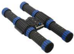
LF-6 and ELF-6