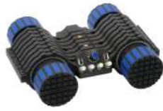
LF-2 and ELF-2