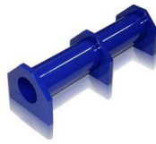
Zero Gauss Chamber